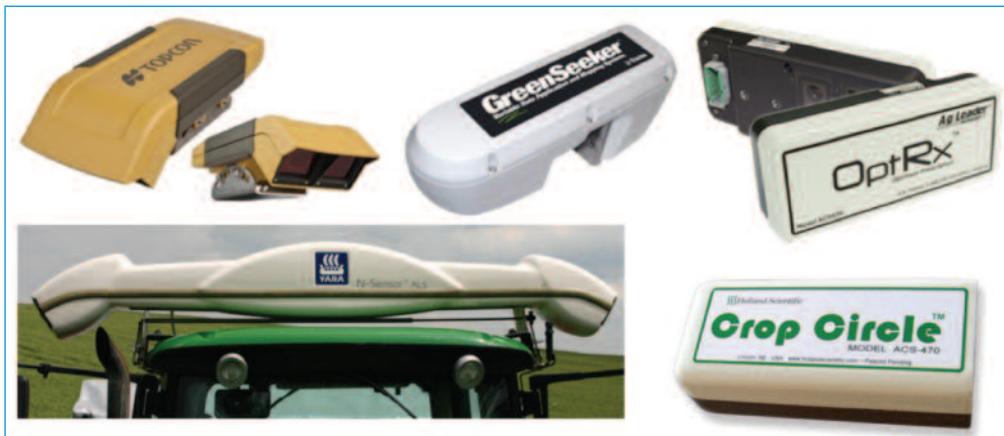
Figure 3. Different commercial radiometric sensors used for on-the-go crop vigour estimation and variable rate fertilizing.

whether site-specific management areas within the field are large enough to justify investing in the required equipment and devices for differential management. As one can see, remote sensing has played, and is playing, an important role in PA and it still has many things to say. Coinciding with the UAV boom, there is also a new revolution in the development of new satellites and sensors. The launch of new satellite missions with improved payloads and the appearance of nanosatellites, increasing both the spatial and temporal resolutions of image series, are opening new possibilities. For example, there are companies (e.g. Planet) that intend to provide daily coverage of the world with a detail of 3-4 m/pixel. For that there will be a constella-