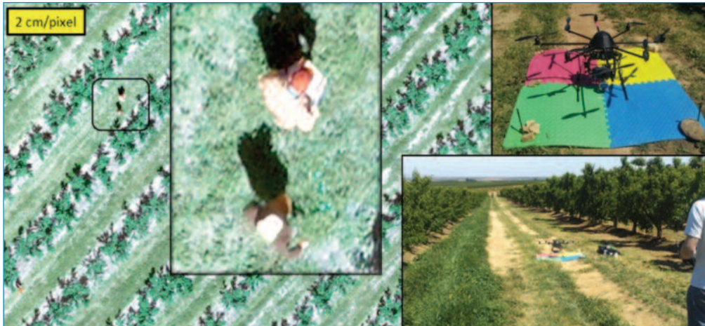
Figure 2. Example of image acquired by an UAV with a resolution of 2 cm/pixel. The figure shows the octocopter used to acquire the image and the level of detail (including two people sampling in the orchard during the flight!).