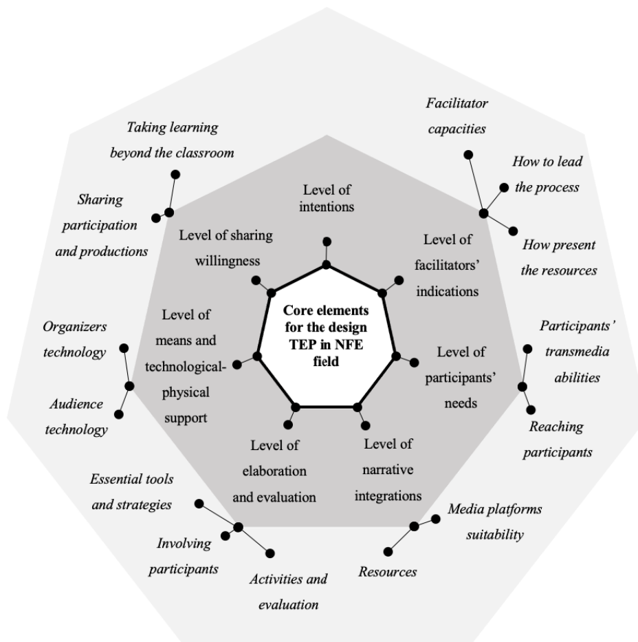
Figure 3. Core elements for design of TEP in NFE field