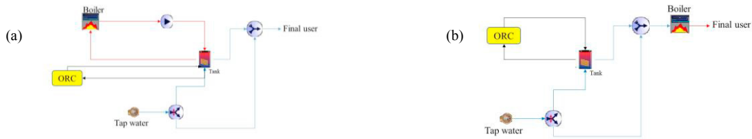
Fig. 2. Schematic of the DHW supply system: (a) boiler integrates energy into the DHW tank; (b) boiler supplies energy directly to final users.

The ORC supplies heat at a design value of 70^{\circ}\text{C} with a temperature difference of 10^{\circ}\text{C} . The heat supplied from the ORC is collected into a thermally stratified water tank by means of an internal coil in order to decouple the thermal energy production with the demand since a time shift between the two can exist. Final users draw hot water from the tank, mixed with tap water to get the final desired supply water temperature. The considered DHW tapping profile was taken from the European standard for domestic hot water systems [11]: every apartment needs daily 360 liters of DHW, corresponding to 11.5 kWh. The DHW tapping temperature profile and power demand are shown in Figure 3. The boiler steps in when the supply water temperature is lower than the design temperature and in the case of Fig. 2a it supplies heat into the DHW tank when the tank temperature is below 60^{\circ}\text{C} , while in the case of Fig. 2b it supplies heat after the tank directly to the users when a surplus heat production is needed.