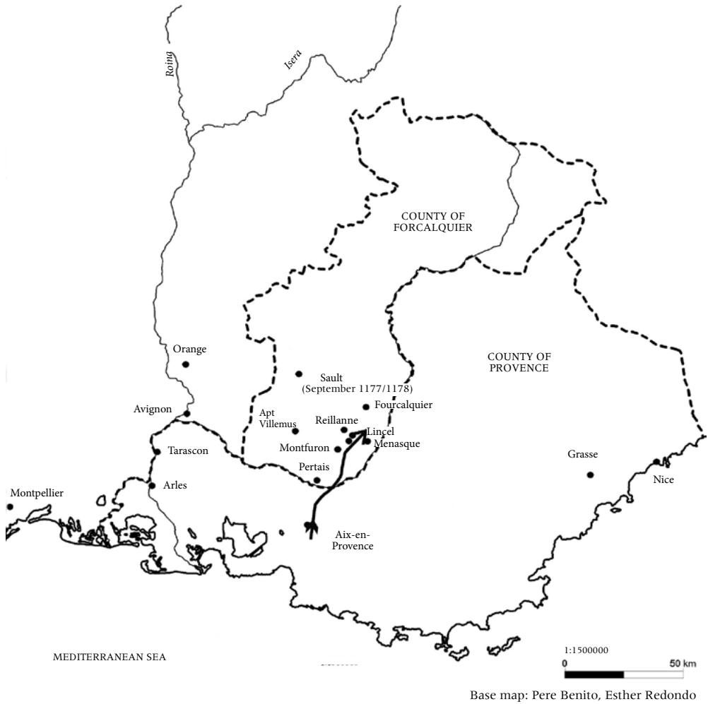
MAPE 2: CAMPAIGN ITINERARY OF ALPHONSE THE CHASTE IN FORCAUQUIER (1177/1178).