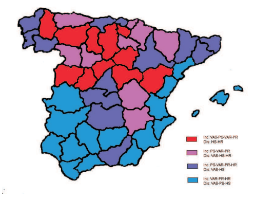
Figure 2: Joint Evolution Non-irrigated/Irrigated

non-significant. In the regression on the agricultural value of non-irrigated land, however, the same coefficients are clearly significant and positive, indicating that the agricultural value of non-irrigated land will suffer a negative effect from a reduction in precipitation.